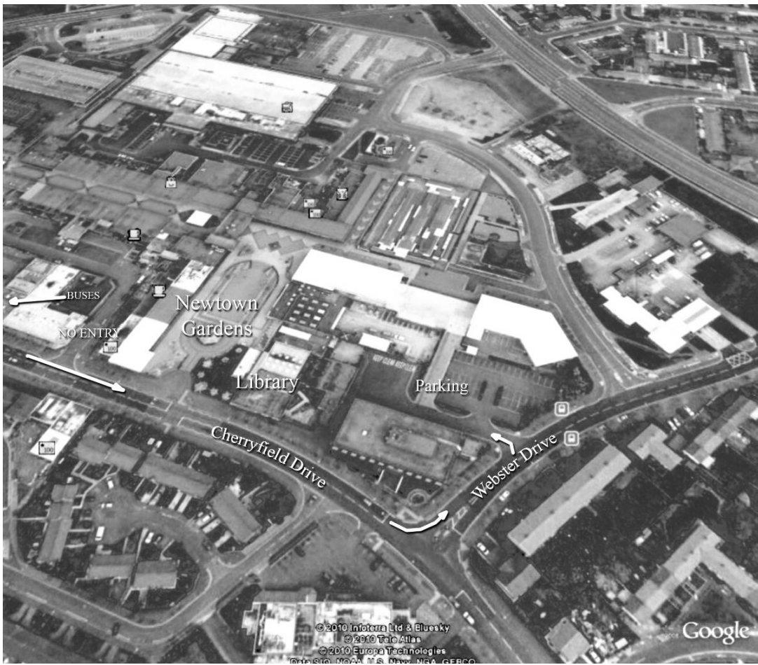
KIRKBY SHOPPING CENTRE & LIBRARY/GALLERY